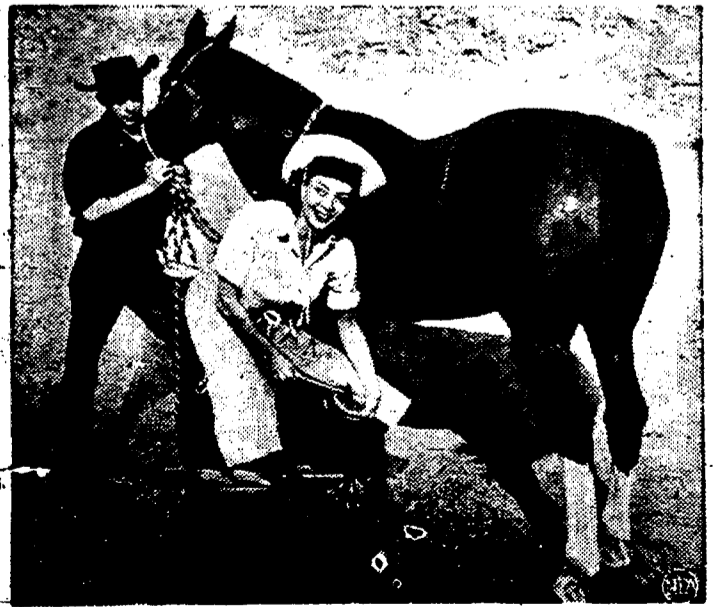
OH, SHOE, SHOE! — Actress Marie Windsor isn't just horsing around for a publicity picture — she really knows how to shoe a horse. And she can tune up a car like a garage mechanic. She picked up the skills when she lived on her parents' ranch.

Our new PRINTED PATTERN — in the season's liveliest new silhouette! It's the Empire-Sheath — all long, slender lines; cleverly banded 'neath the bosom for the new high-waisted look. Pure flattery for your figure! Printed Pattern 4789: Misses' Sizes 12, 14, 16, 18, 20. Size 16 requires 3 1/2 yards 39-inch fabric. Directions printed on each tissue pattern part. Easy-to-use, accurate, assures perfect fit. Send THIRTY-FIVE CENTS (stamps cannot be accepted, use postal note for safety) for this pattern. Print plainly SIZE, NAME, ADDRESS, STYLE NUMBER. Send order to ANNE ADAMS, 123 Eighteenth St., New Toronto, Ont.