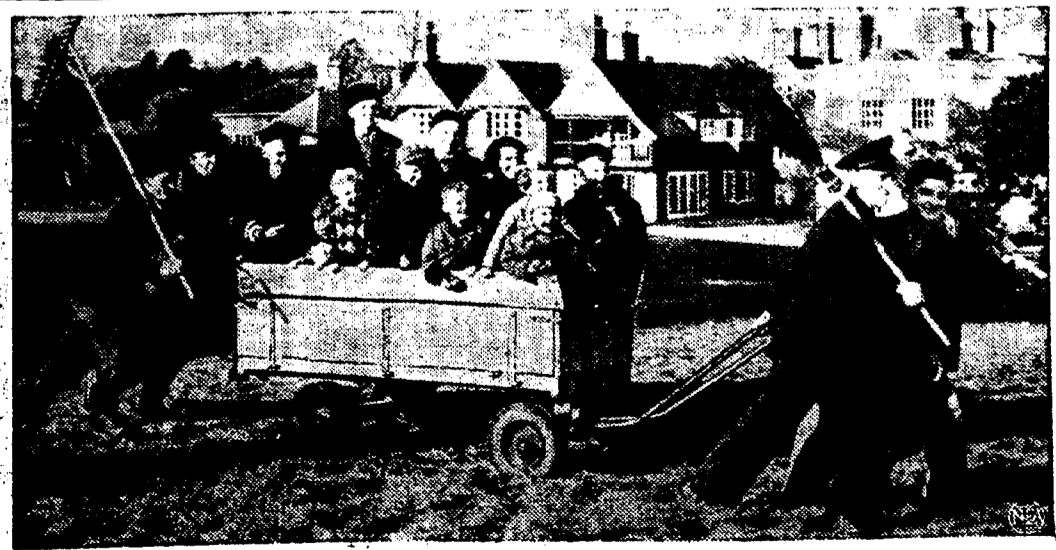
HAPPY DAYS ARE HERE AGAIN — With bitter memories of the terror and flight from revolution-torn Hungary in the background, these young Hungarian refugees have fun in a handball game on the grounds of Foxlease, Lyndhurst, England. Foxlease, home of the Girl Guide movement, is used to house some of the many refugee families who have sought haven in England.