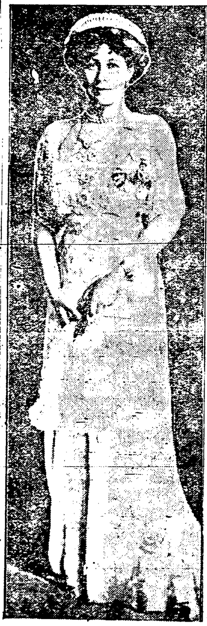
LADY HARDINGE, Vice-Queen of India, who died at a London nursing home after undergoing an operation. She was 46 years old, and was married to Baron Hardinge in 1890, and leaves two sons and a daughter.