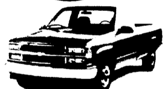
'98 Chevy Full-Size Regular Cab

Vortec 4300 V6 engine, automatic transmission with overdrive, 4-wheel ABS, dual front air bags, deluxe chrome grille, cloth seats, chrome plated wheels.