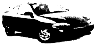
'98 Chevrolet Cavalier Coupe

2.9% UP TO 48 MONTHS* GMAC PURCHASE FINANCING ON THESE 1998 CHEVROLET & OLDSMOBILE MODELS: Cavalier, Malibu, Lumina, Monte Carlo, Intrigue, Eighty Eight, Aurora, Camaro, Metro, Tracker, Tahoe, Suburban, Blazer S-10