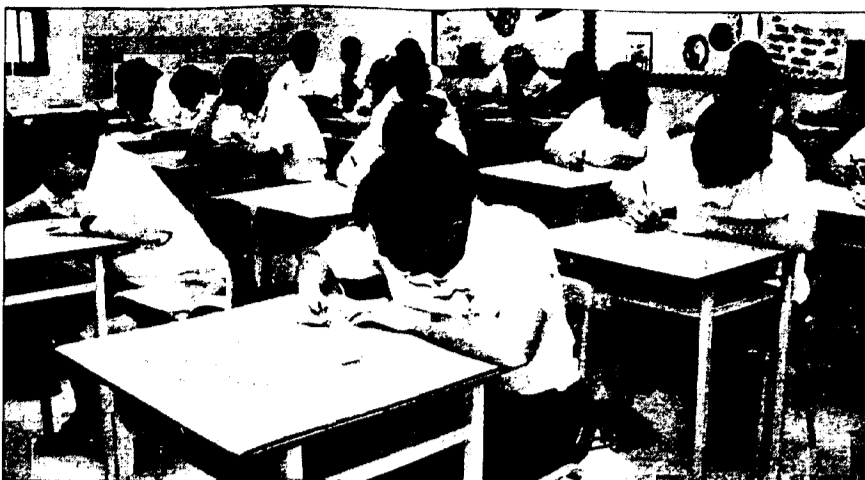
Charter schools differ from public school systems and have enjoyed success in Alberta. However, the Ontario government says charter schools aren't an option here at home.