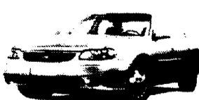
'98 Chevrolet Malibu

2.4 litre Twin Cam engine, automatic transmission with overdrive, 4-wheel ABS, dual front air bags, AM/FM stereo with cassette, air conditioning.