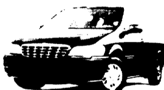
'98 Chevy Venture Van

3400 V6 engine, automatic transmission with overdrive, 4-wheel ABS, dual front and side air bags, air conditioning, programmable power door locks.