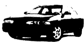
'98 Oldsmobile Intrigue

3800 Series II V6 engine, automatic transmission with overdrive, 4-wheel ABS, dual front air bags, power windows/mirrors/programmable door locks, AM/FM stereo with cassette and 6-speaker Dimensional Sound System, air conditioning.