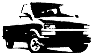
'98 Chevy Astro Van

ALL 1997 & 98 VEHICLE VENTURE FULL SIZE PICKUPS CHEVY ASTRO AND OLDSMOBILE SILHOUETTE